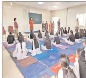
Students participating in training programme.