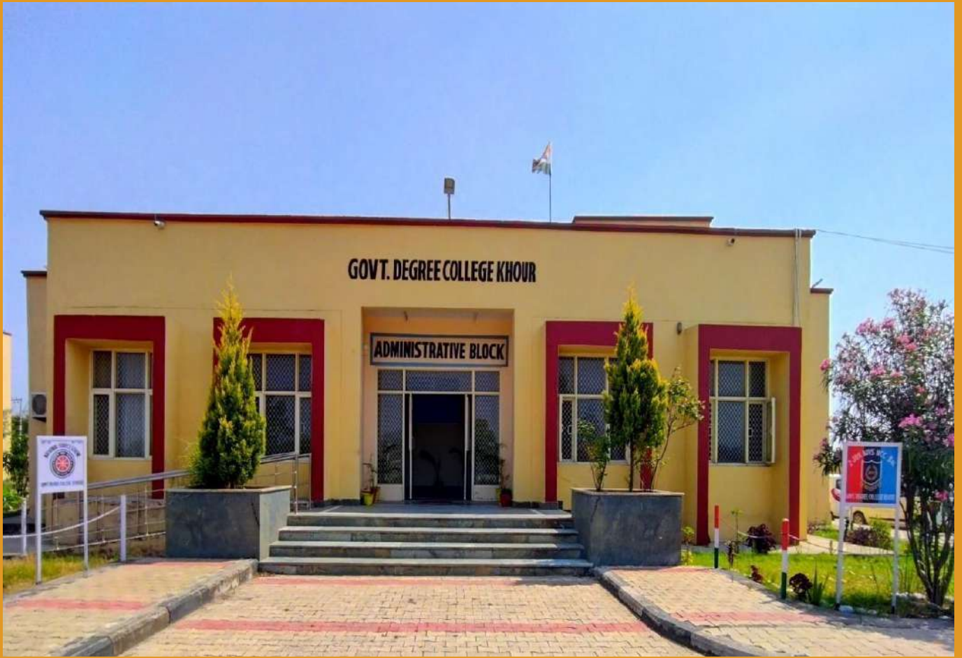
GDC KHOUR CAMPUS