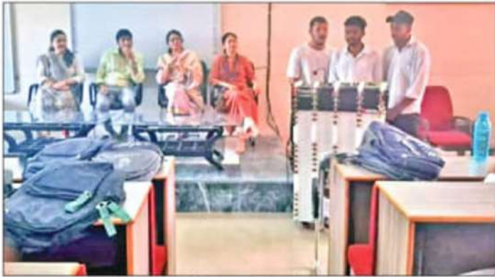
Singing, Essay Writing competition held at GDC Khour.

STATE TIMES NEWS KHOUR: The Cultural committee of GDC Khour organized Essay Writing competition and Singing competition on Mahatma Gandhi's Ideology "Truth and Non-Violence" under the activities planned regarding the celebration of Gandhi Jayanti. This program aimed to develop the teachings and values of Mahatma Gandhi and to make