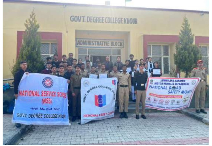
Road Safety week