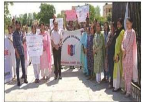
Students during awareness rally.