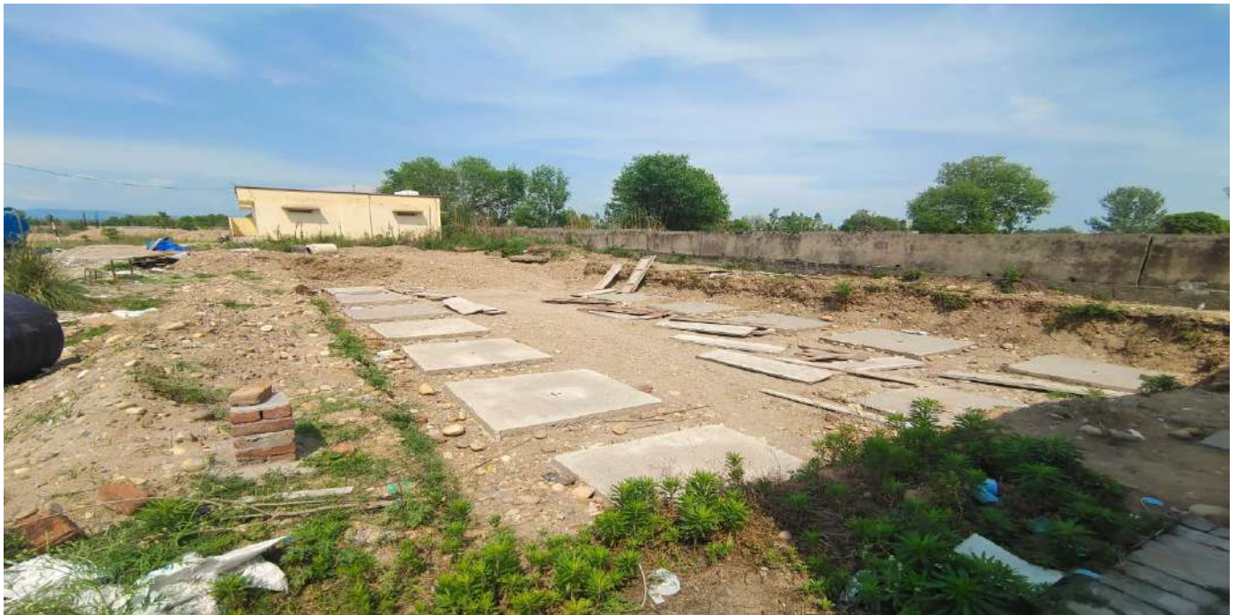
Skill Development Centre

Examination Hall: A newly constructed examination hall is also functional for the conduct of internal and external semester examinations in the college premises for the students.