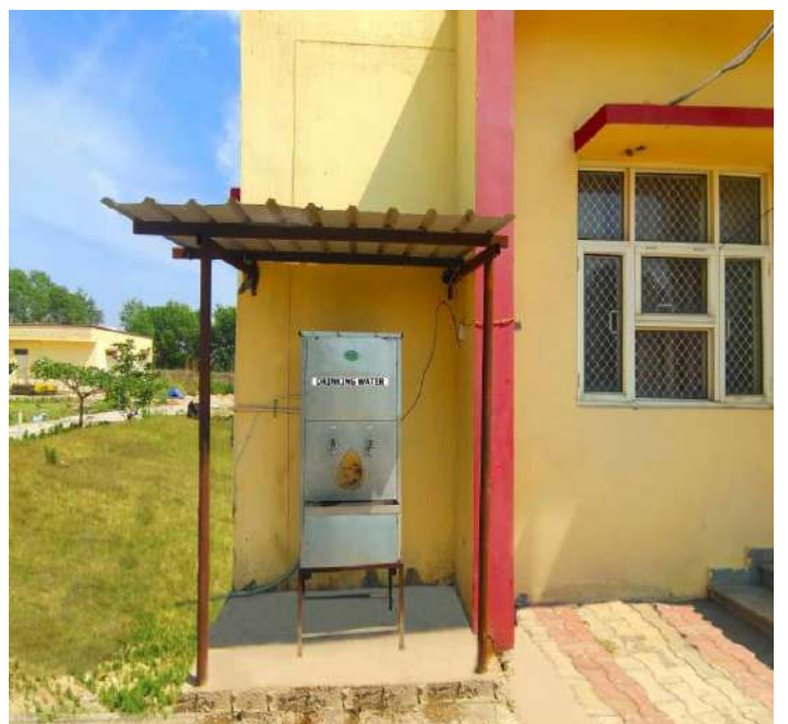
Drinking Water Facilities