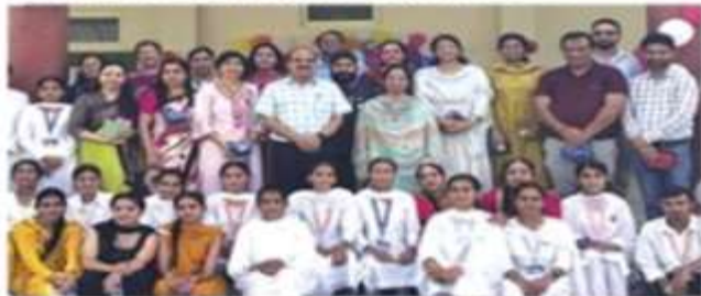
Staff and students during celebrations of Teachers day at GDC Khour