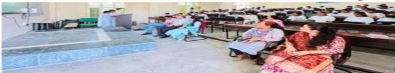
Participants during celebrations of NSS Foundation Day at GDC Khour.