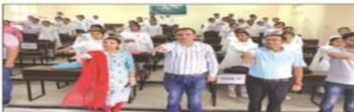
A view of pledge ceremony.