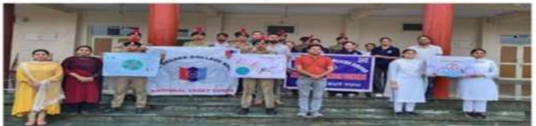
Students during pledge ceremony at GDC Khour.

JAMMU, June 26: In connection with the observance of the International Day against Drug Abuse & Illicit trafficking on June 26th 2025, the NSS & NCC units of the Government Degree College Khour organized a pledge ceremony and poster presentation. The event aimed to reinforce College commitment to fight Drug Abuse and build a healthier drug free society. Over 30 participants including NSS volunteers, NCC cadets, teachers & non-teaching staff of the College took a solemn oath to stay away from drugs and help others to do the same. The Nasha Mukh Bharat Pledge included commitments to lead a drug free life, educate others about the harmful effects