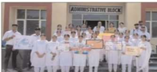
Faculty members along with students during the event.

KHOUR: The Government Degree College Khour organized a series of activities to celebrate Gandhi Jayanti, honoring the birth anniversary of Mahatma Gandhi, the Father of the Nation. The celebration was marked by active participation from students and faculty members, who came together to pay tribute to Gandhiji's teachings and ideas. As part of the celebrations, a thought-provoking movie depicting the life and journey of Mahatma Gandhi was screened for the students and staff, providing insights into his relentless