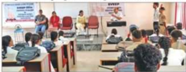
Faculty members speaking during a programme at GDC Khour.