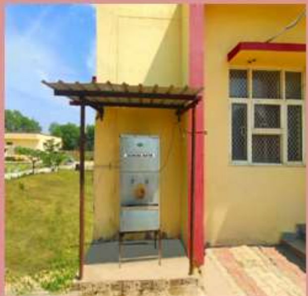
Drinking Water Facilities