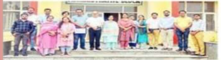
Newly Elected Staff Secretary Poses for Photograph.