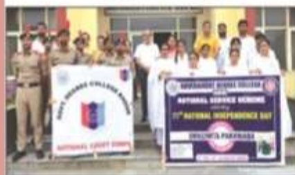
A view of Essay Writing Competition.