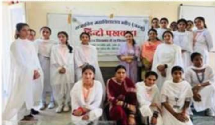
Students, Staff pose for group photograph.