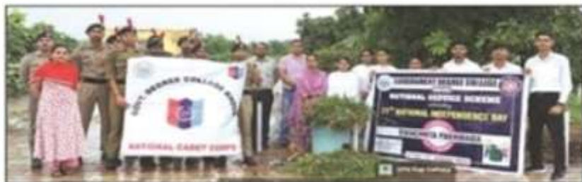
A view of cleanliness drive.