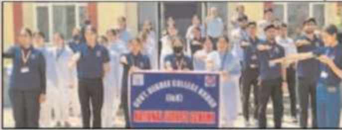
Faculty members and students during the event.